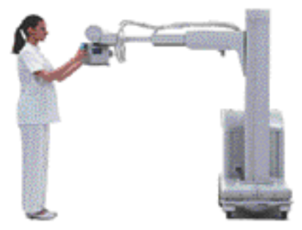
Telescopic X-Y column

The final design was arrived at through numerous handling tests at the development stage by staff, as many aspects of these functions cannot be evaluated in numerical terms.