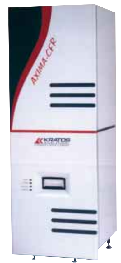
MALDI-TOF Mass Spectrometer - AXIMA-CFR

ization planned for late 2001); Both parties are planning to reinforce the partnership by expanding from protein-related applications into biotechnology as a whole.