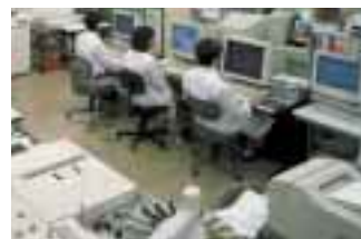
Analysis data processing room

As a fully owned Shimadzu subsidiary, Shimadzu Techno-Research Inc. was formed to conduct contract analysis of environmental substances in 1972. As the environmental monitoring field subsequently expanded, the company grew to lead the Japanese environmental monitoring industry, particularly